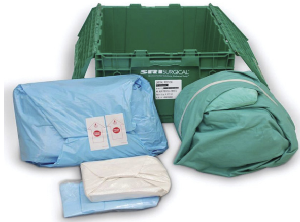
Figure 7. A hybrid pack, showing a mix of reusable and disposable sterile supplies.

In a letter to the editor of the AORN Journal , Belkin wrote, “The amount of red bag medical waste can be reduced by judicious use of reusable items. Perhaps a mix of reusable and disposable products will prove to be the optimal choice.” 17(p16) In December 2008, a major supplier of disposable surgical products announced a partnership with a national FDA-approved company that provides reprocessing and sterilization of nondisposable surgical gowns, towels, table covers, drapes, and basin ware. 18 Collectively, this copartnership creates hybrid packs that supply both nondisposable and disposable products as one unit (Figure 7). In