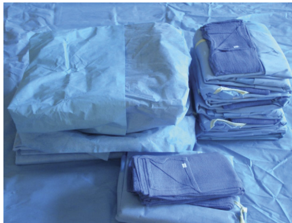
Figure 2. Example of an open sterile disposable pack used at the facilities.

After the comparative exercise, we administered a questionnaire to the surgeons and surgical technologists, which asked them to compare the current disposable products to those used during