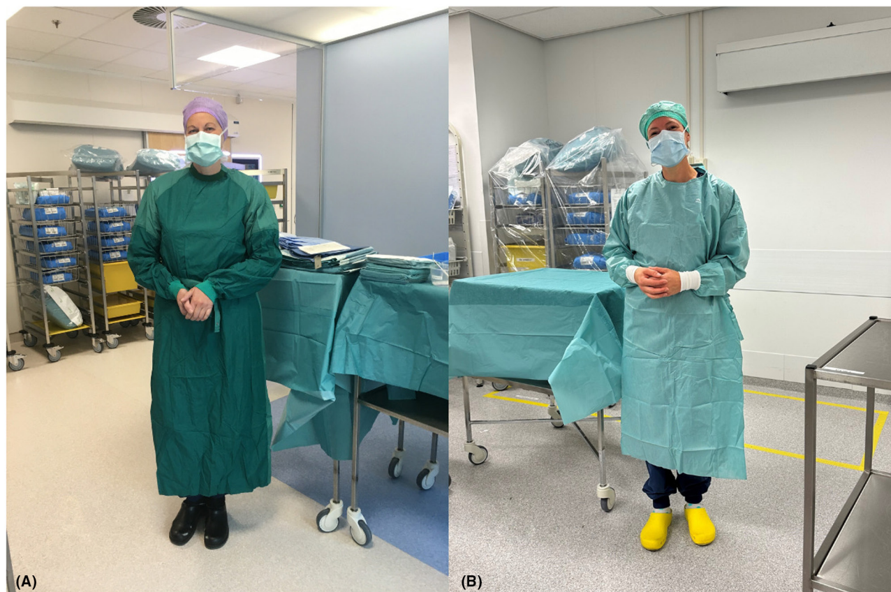
FIGURE 1 Reusable and disposable sterile surgical gowns. (A) Reusable surgical gown. (B) Disposable surgical gown.